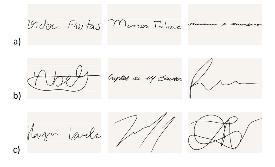
Figure 1: a) Simple 1,2 and 3, b) Medium 1, 2 and 3, and c) Complex 1, 2 and 3 Source Signatures

Results were analysed by assessing the performance of forgers on each of the signatures across multiple attempts and model sizes. The analysis focuses on overall performance in terms of verification thresholds, improvements over time and the effect of signature complexity on ability to forge. Full ethical approval was granted for this study.