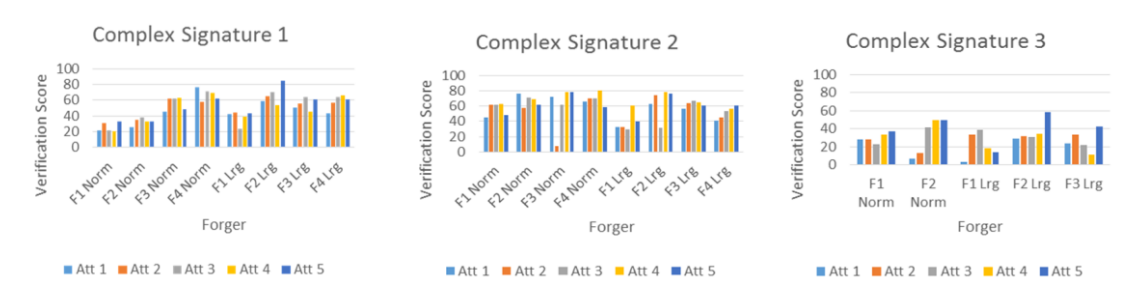
Figure 6: Complex Signature Attempts

Signature 2 it is possible to establish that forgers produce a signature a similar profile to those in the Medium group – indeed this signature contained lower ink travel distance and thus is directly comparable to Medium Signatures 1 and 3. The average scores also vary considerably across attempts indicating that the forger is trying to copy the signature by trial-and-error. Analysing the average scores obtained for Complex Signature 1 the results show that the number of attempts for this signature is not too import, since both graphs indicate little improvement over the five attempts. It is interesting to see that in this case the size of the model signature does not have an effect on performance, as normal and magnified signatures produce interchangeable results. Complex Signature 3 is the hardest to assess. It is possible to see an enhancement of verification scores but the low values associated with these attempts shows the difficulty associated with forging this signature.