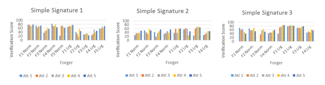
Figure 2: Simple Signature Attempts (Norm=Normal modal size, Lrg=Magnified model size, Att=Attempt)

four forgery attempts for these signatures). Here it is clear that the best results were obtained when the forger was copying from a real sized model signature. It is also possible to note that, compared to the simple signatures, the average scores related to medium signatures is relatively flat and thus not directly related to the amount of attempts that the forger undertakes. It can also be noted that for Medium Signatures 1 and 3, which have relatively lower ink travel length, the ability to obtain a high verification score (and hence successfully verify on the system) is enhanced. It is seen that an average score is maintained for all the attempts when dealing with a normal size image. However when the forger is viewing a magnified model image, the verification scores are not as stable as when copying from a normal size image. The amount of detail that is shown in a magnified image of a medium signature may affect the way the forger approaches their copy, leading to poorer results.