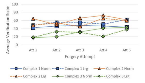
Figure 7: Complex Signatures – Average Verification Score per Attempt