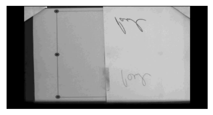
Figure 1.1. A completed simulation trial.

Simulations were produced at least 5° below the exemplar, removing the ability of subjects to acquire visual information using parafoveal vision. An example of a completed signature simulation trial from the view of the scene camera is shown below in Figure 1.1.