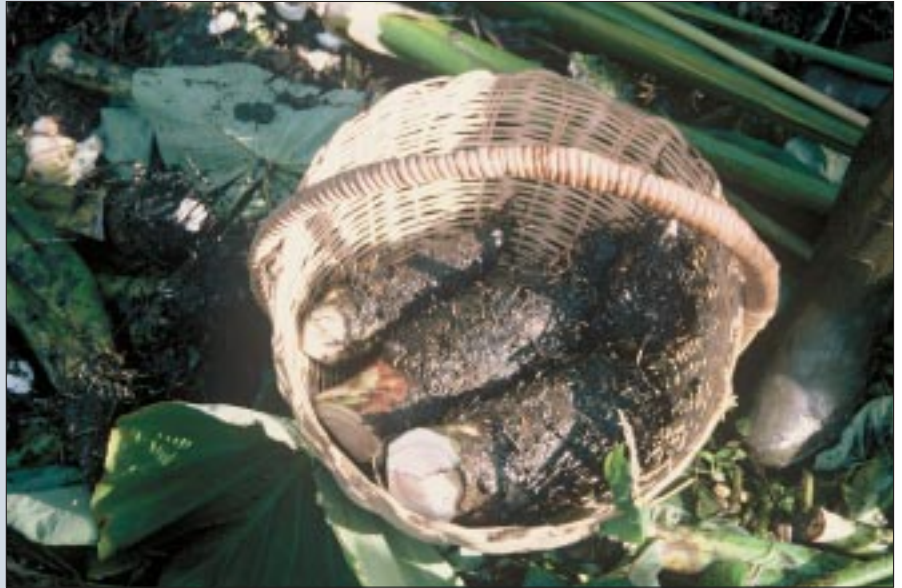
Photo 1. Corms of madère noire taro.

2 Present address: École nationale des ingénieurs des travaux agricoles de Bordeaux Enitab BP 201 3175 Gradignan Cedex (France)