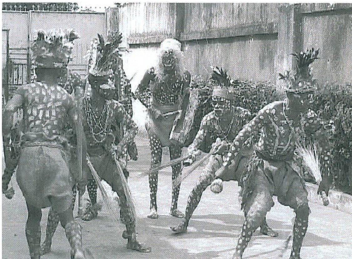
Fig. 3. An Ekonda holding an ikookolé (slit drum).