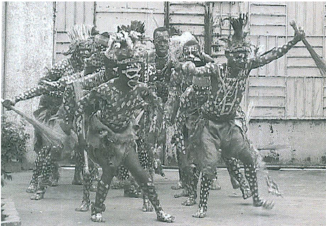
Fig. 8. Ekonda performers forming two parallel rows.