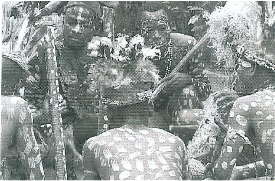
Fig. 7. Ekonda performers forming a circle.