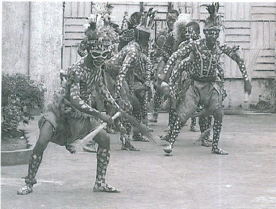
Fig. 1. Ekondas singing and dancing, holding kikombo (brooms).