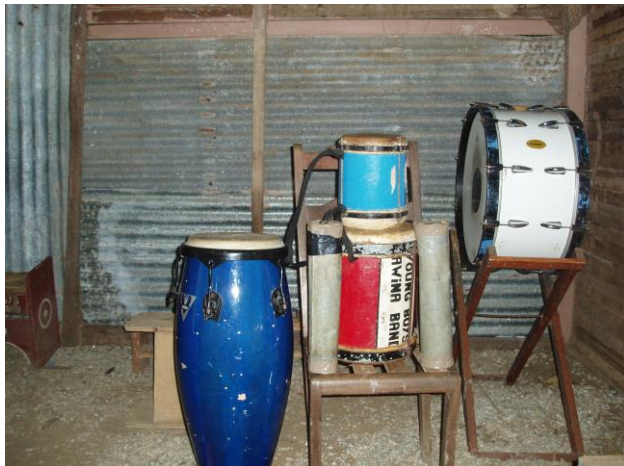
Timbal, chaka, koti, lumba et djansi (groupe Young Boys, Kourou).

In the Saamaka language, the word kawina is made up from the demonstrative ( ka = that), and the verb wina (= to vibrate, tremble, shudder), whence the word kawina : “vibration, what vibrates and shakes, which gives a start; it’s going to quiver”).