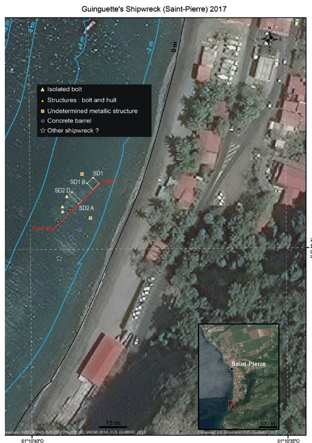
Figure 3: Map of Guinguette site (Map by Émilie Lagahé, 2017.)

In order to identify additional candidates for the Guinguette beach wreck, archival research was conducted around four hurricanes that occurred at the end of the 19th century. Archives indicate five ships that were lost in the area of the south anchorage as a result of a hurricane on the 9th of September, 1883. In French ships anchorage they are listed as: P.-A.-J. French three-masts, captain Metaireau loaded for Bordeaux ; Tapageur , Captain Gombeaud coming from Bordeaux loaded ; Bayardère , Captain Letestu being loaded for Le Havre; Mysore , Captain Mahé loaded for Le Havre; Lemnos , Captain Lampoignard loaded for Bordeaux ; Misti , Captain Landgrain coming from Guadeloupe loaded with rice (Journal officiel de la Martinique 7/9/1883). Seven ships were lost in the Saint-Pierre area due to the hurricane on the 18th of August, 1891. These reportedly include at Grosse Roche: French ship Perséverant , French schooner