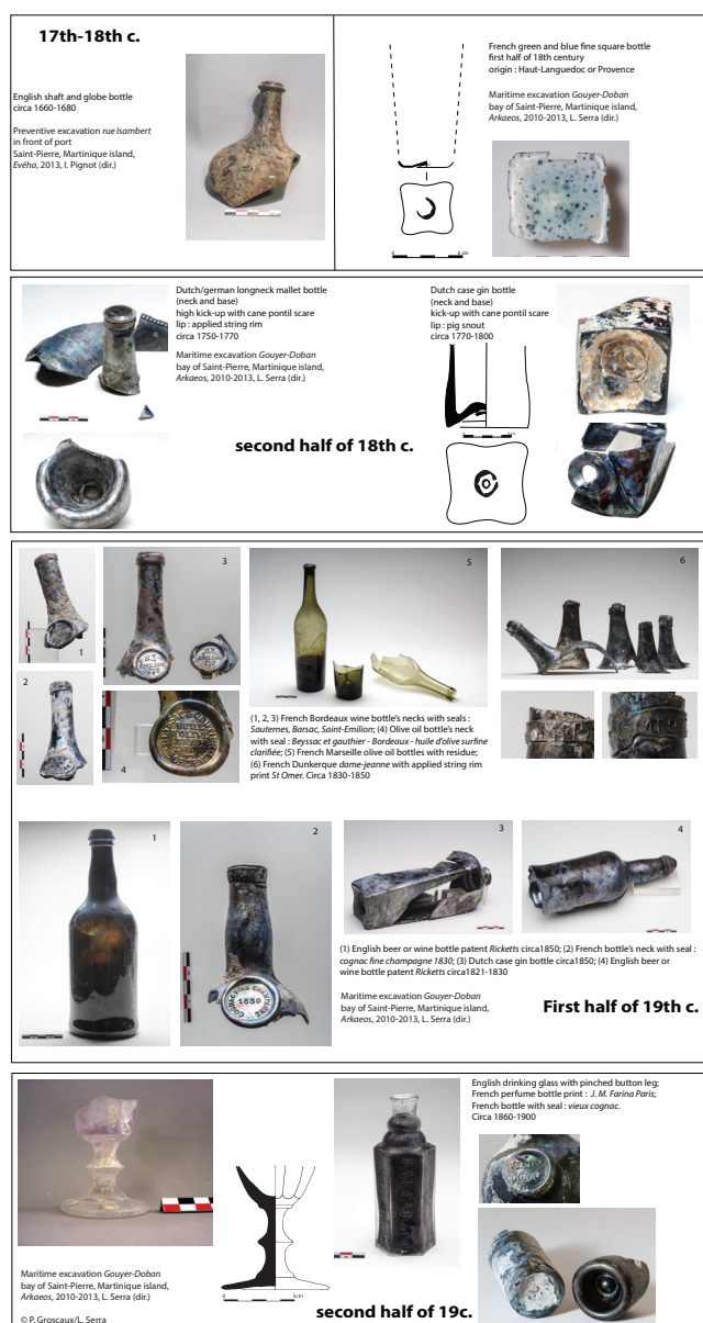
Figure 2: Glass artifacts found in the Doban site