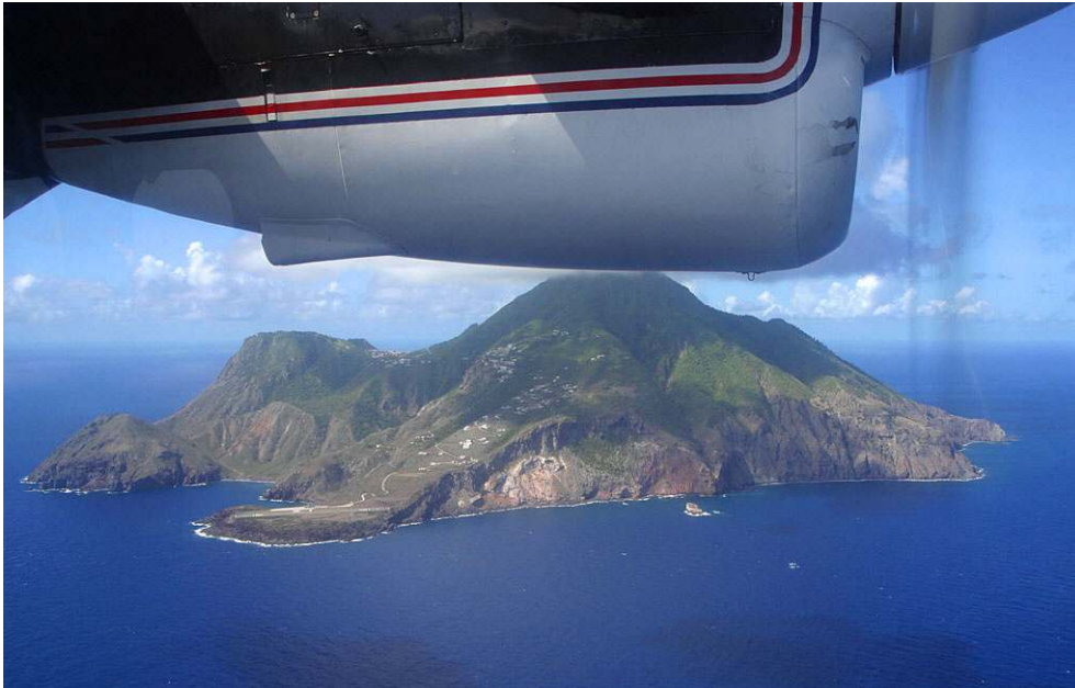
Photo 1. Aerial view of the North-eastern sector of the island of Saba

an accentuated orography, protected by a thick tropical forest which contrasts with its coastline formed of rough, very jagged cliffs.