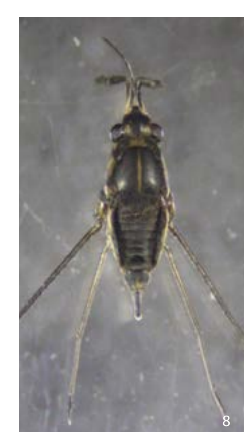
Photo 8 Rheumatobates trinitatis