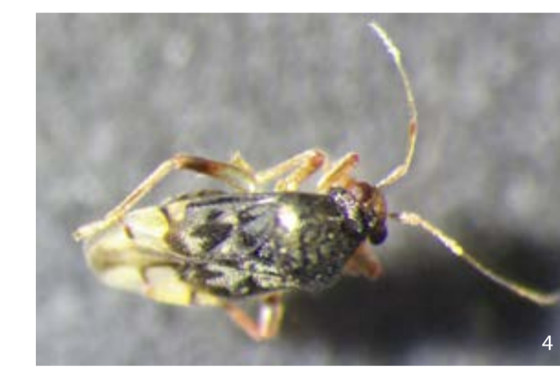
Photo 4 Miridae