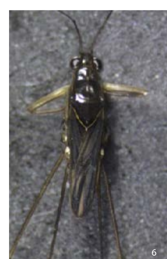
Photo 6 Limnogonus franciscanus