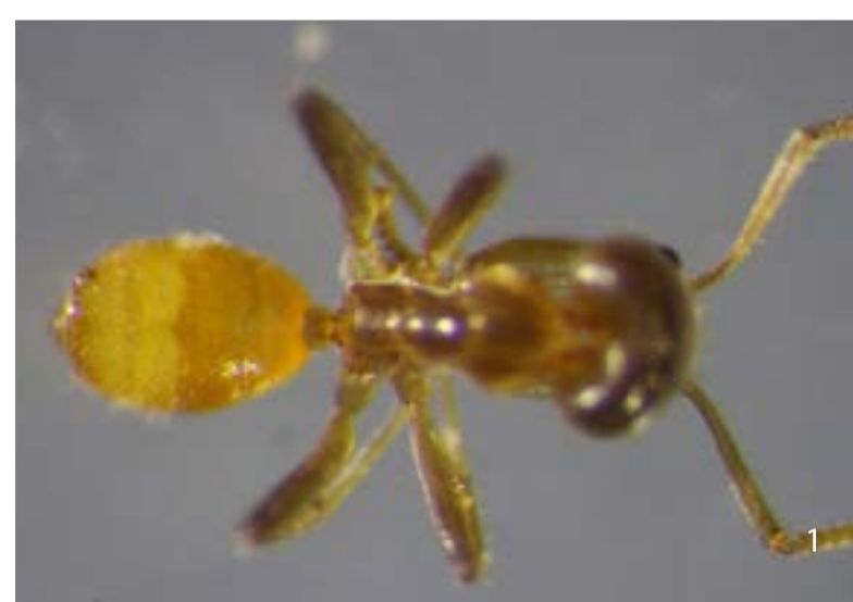
Photo 1 Azteca delpini antillana