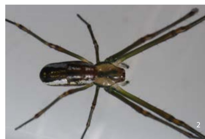
Photo 2 Leucauge sp.