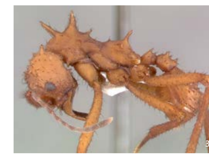
Photo 3 Acromyrmex octospinosus