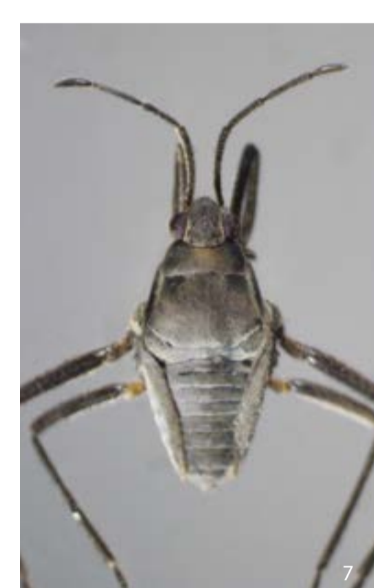
Photo 7 Rhagovalia plumbea