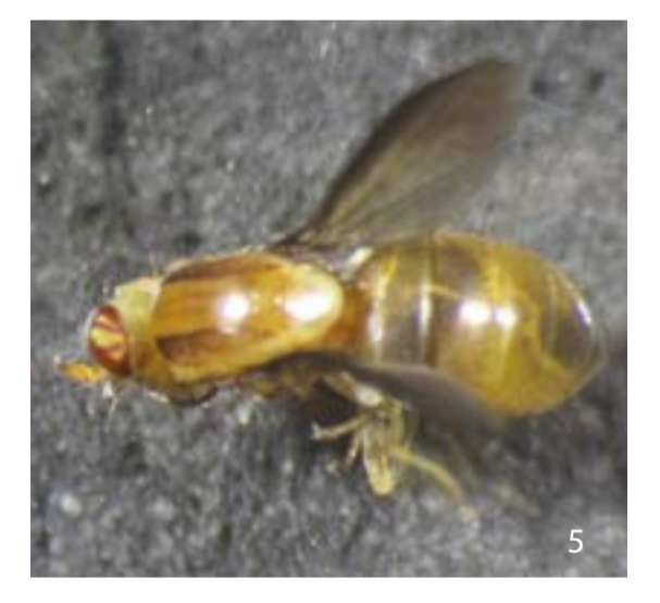
Photo 5 Brachycera